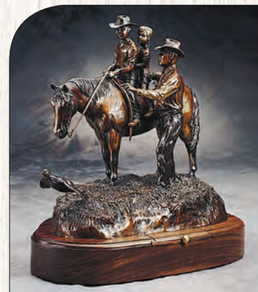
"Caretakers of the Land" bronze gifted to National winner.

February 2018: All seven regional winners are expected to attend the 2018 Cattle Industry Convention in Phoenix, Arizona. Travel and registration will be paid by the Environmental Stewardship Award for two people.